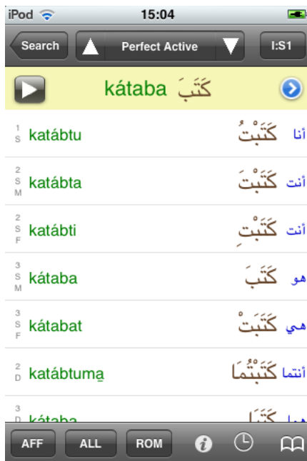
Figure 7: Explicit indication of stress and neutralization.