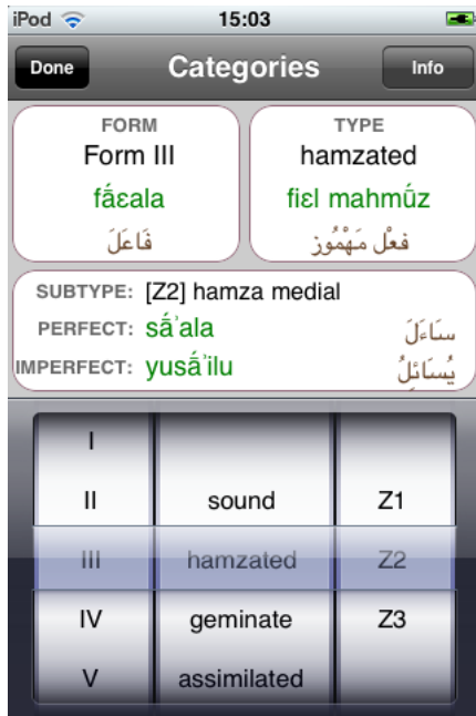
Figure 6: Scroll wheel to quickly access verb categories.