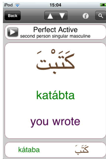
Figure 5: Detailed information in large, easy-to-read fonts.

Special efforts were made to design a functional user interface that ensures maximum user friendliness and rapid access. This includes an interface object